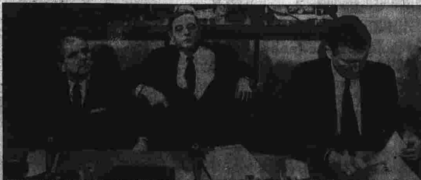
New York City's major mayoralty candidates met for a television debate yesterday—their final face-to-face meeting before tomorrow's election. They are: left to right, Democrat Abraham D. Beame, Conservative William F. Buckley Jr. and Republican John Lindsay.