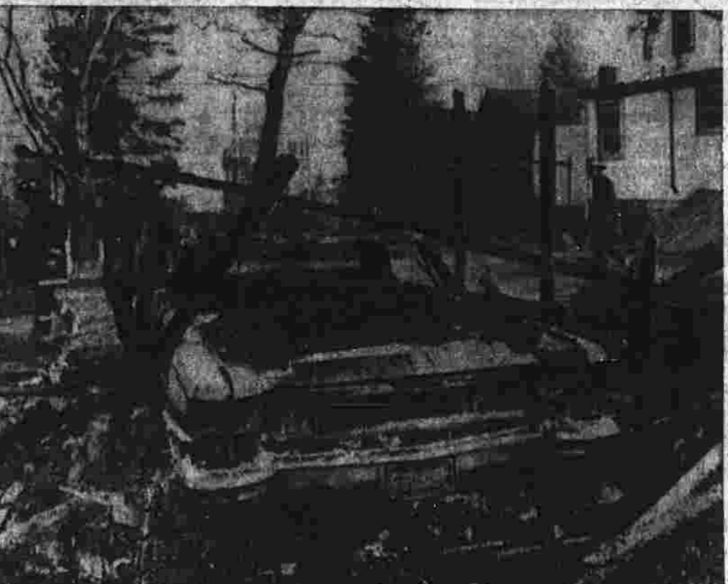
Fire in Dedham Razed Garage, Left Burned-Out Auto